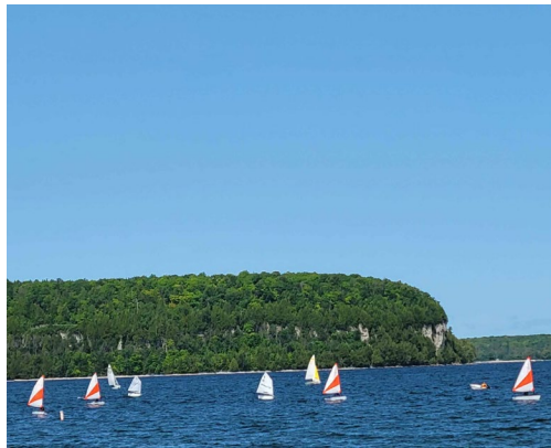
Sailboats in Ephraim, Wisconsin, July 2023

He fills our sails, empowers our passage Displaying His strength, God is glorified Obediently we bring forth His message Lowly vessels set sail, Spirit-fortified