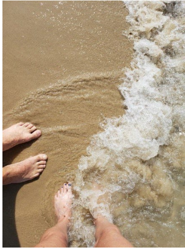
Mediterranean Sea, Tel Aviv, Israel 2019