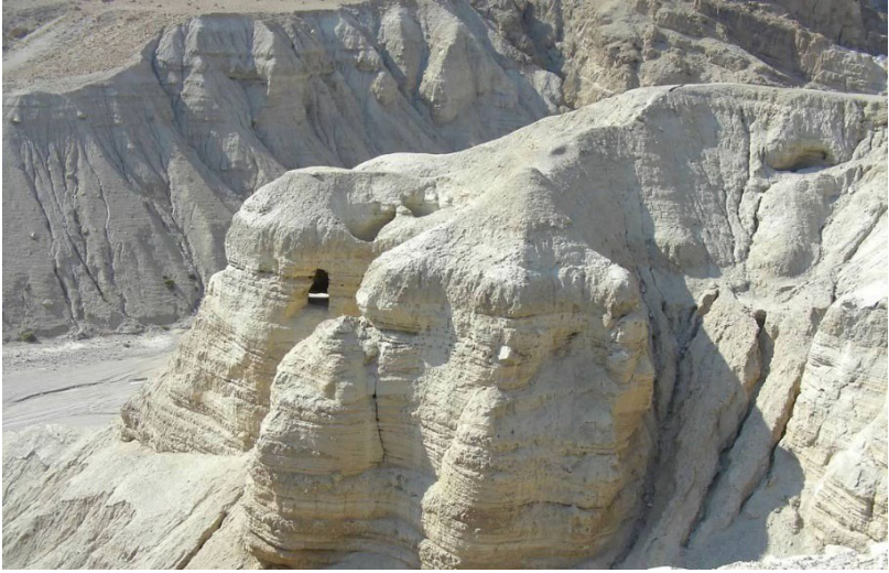
Qumran, Location of the Dead Sea Scrolls, Israel 2006