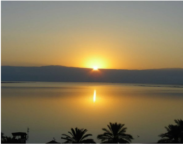
Sunrise over the Dead Sea, Israel 2006