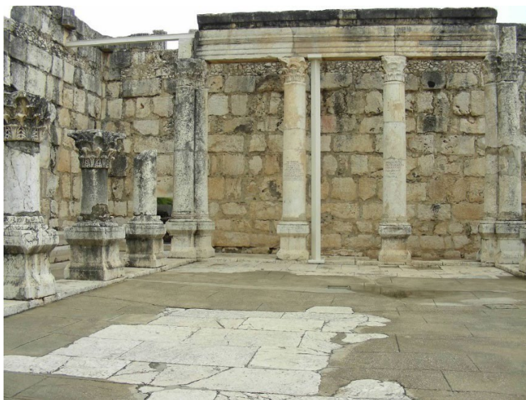
Synagogue in Capernaum, Israel 2006

from going down to the pit [of destruction]; I have found a ransom [a consideration, or reason for redemption, an atonement]! Let his flesh be restored and become fresher than in youth; Let him return to the days of his youthful strength. He will pray to God, and He shall be favorable to him, so that he looks at His face with joy; for God restores to man His righteousness...” (Job 33:15-26 AMP)