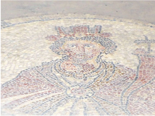
Mosaic in Bet She'an, Israel 2013