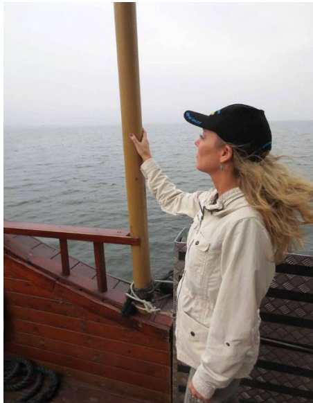
Solitude on the Sea of Galilee