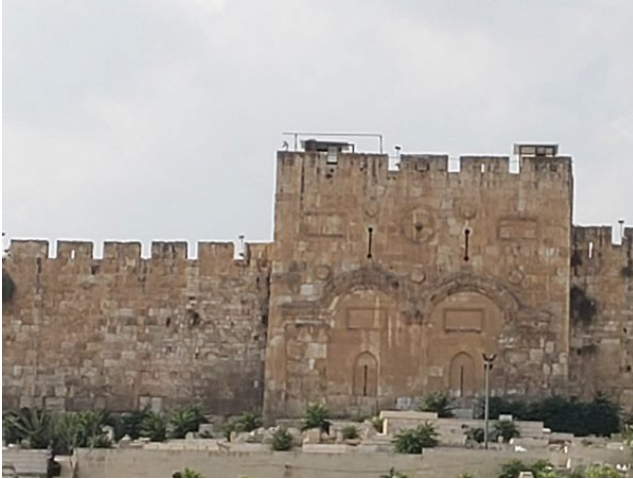
Old City Walls, Eastern Gate Jerusalem, Israel 2019

“The LORD is my rock, my fortress, and the One who rescues me; My God, my rock and strength in whom I trust and take refuge; My shield, and the horn of my salvation, my high tower—my stronghold.” (Psalm 18:2)