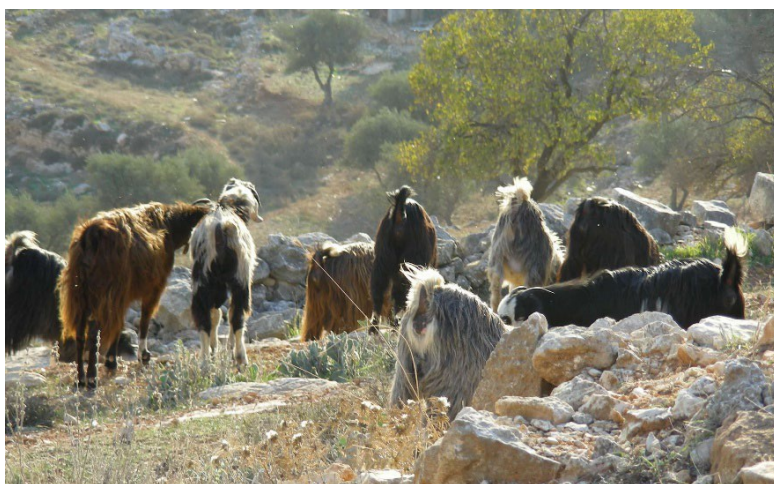
The Shepherds' Fields of Bethlehem, Israel 2006

and refuse to partake any longer of the hard labors commanded by the sin nature. Jesus has overthrown the world, the flesh, and the devil. The way we share in His victory is to walk in His ways while rejecting our own. Draw near to the Lord with a pure heart fully devoted to the Shepherd of our souls, for He who promised is faithful. “Let us draw near with a true heart in full assurance of faith, having our hearts sprinkled from an evil conscience and our bodies washed with pure water. Let us hold fast the confession of our hope without wavering, for He who promised is faithful... ” (Hebrews 10:22,23)