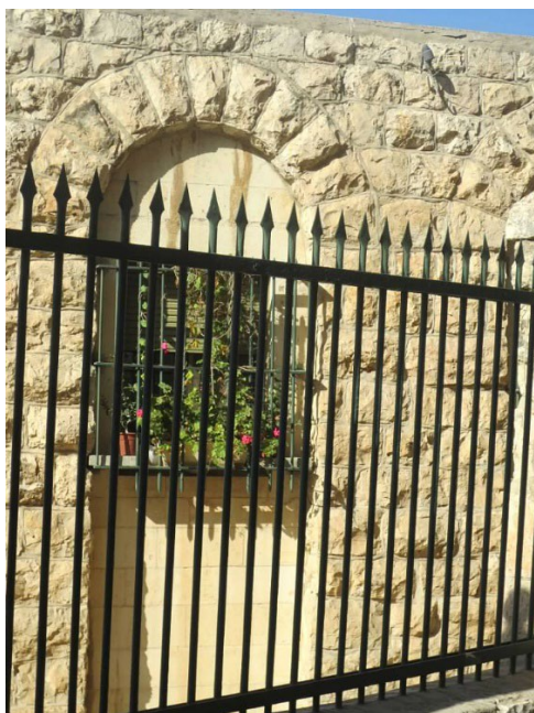
Iron Bars on the Mount of Olives Jerusalem, Israel 2013