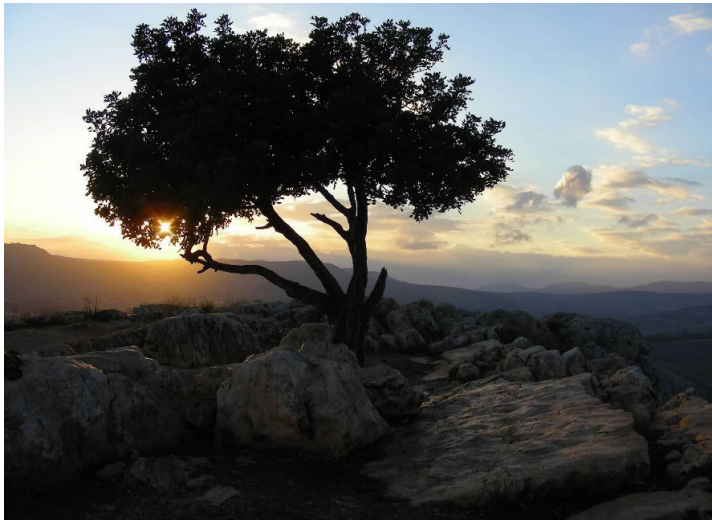
Mount Arbel, Galilee Israel 2006

rejoicing in God and His gracious, merciful provision of salvation and guidance. To rejoice in the Lord is to praise God's holy Name by striving to walk in His holy ways. “Rejoice in the Lord always. Again I will say, rejoice!” (Philippians 4:4) The Christian who ‘rejoices in the Lord always’ is a Christian who glorifies God in everything they do, no matter the circumstances, having a cheerful, content, and surrendered heart of love. May we reflect the joy of the Lord as we walk hand in hand with Him on the higher, narrower paths He has called us all to travel. In this, is fullness of joy.