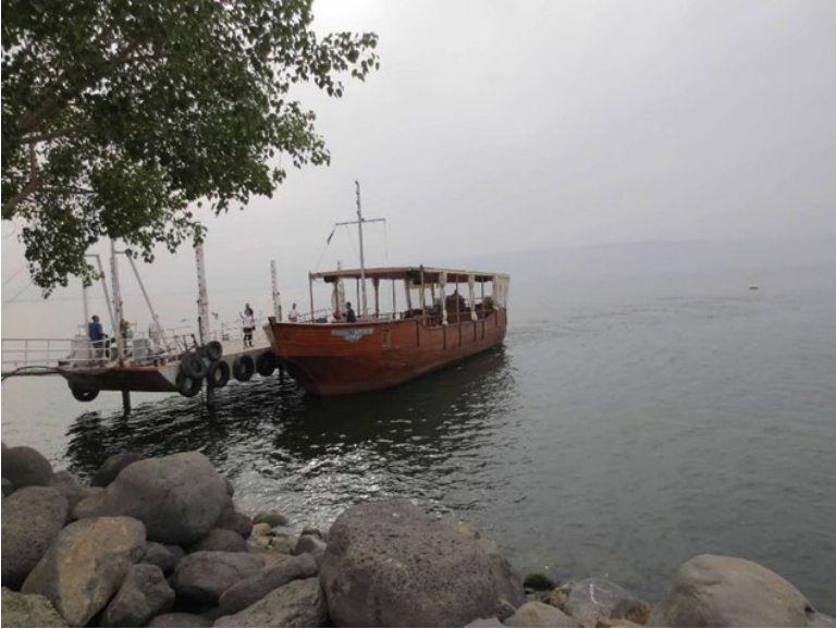
Sea of Galilee Tiberias, Israel 2013