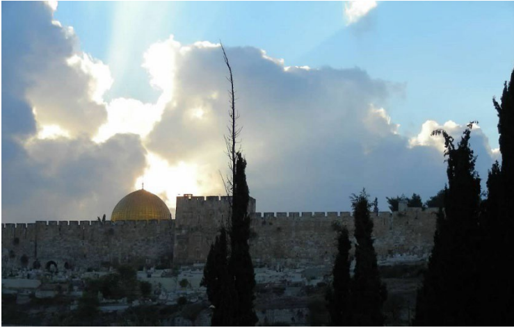
East Gate, Temple Mount Jerusalem, Israel 2006

“And the glory of the LORD came into the temple by way of the gate which faces toward the east.” (Ezekiel 43:4)