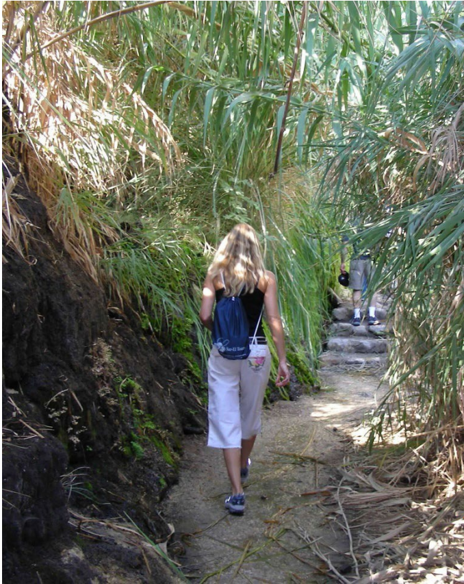
Following the Path