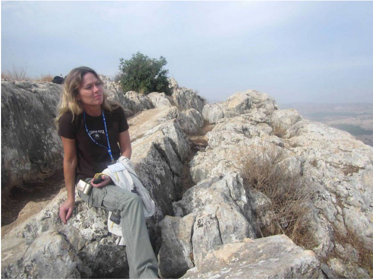
White stones atop Mount Arbel, Israel 2013