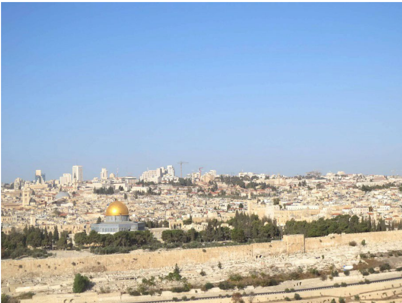
Temple Mount in Jerusalem, Israel 2013

I have said it before and I will say it again. Be willing to be different. Be willing to let God change you even when it causes social awkwardness or a disruption of comfortable habits. Be willing to pick up your cross daily and walk where Jesus walked. It is only in doing such things that we can have any kind of significant impact on others. We are to be a shining light of God and it is solely by His holy fire burning brightly within us that we can overcome the darkness of this fallen world. Far too many of us are not really shining His light. We have surrendered to the darkness around us by partaking in its activities. May we examine ourselves. If we have been giving away what God has already claimed, let us take back that ground and place it at the throne of heaven for the Lord to cleanse, correct, rule, and make holy once again.